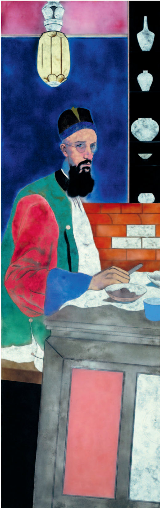
The Orientalist, 1975–77 Oil on canvas, 244 × 76 cm